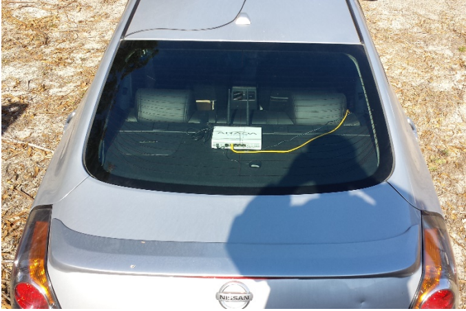
Test vehicle and OBE