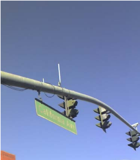
DSRC Antenna at El Camino Real and California Ave.