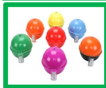
Electronic Markers For Buried Pull Box