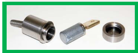
Pull Box Security Screws