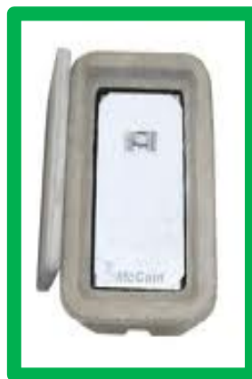
Pull Box Inserts